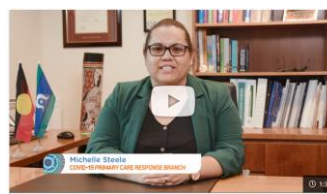
Why vaccines are important