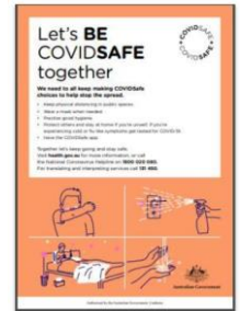
Living the new normal