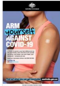
Arm yourself poster