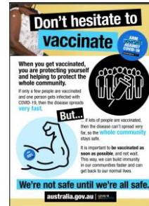
Don't hesitate to vaccinate