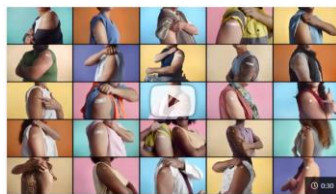
Arm yourself against COVID-19