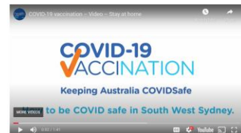
Stay Home during Sydney outbreak